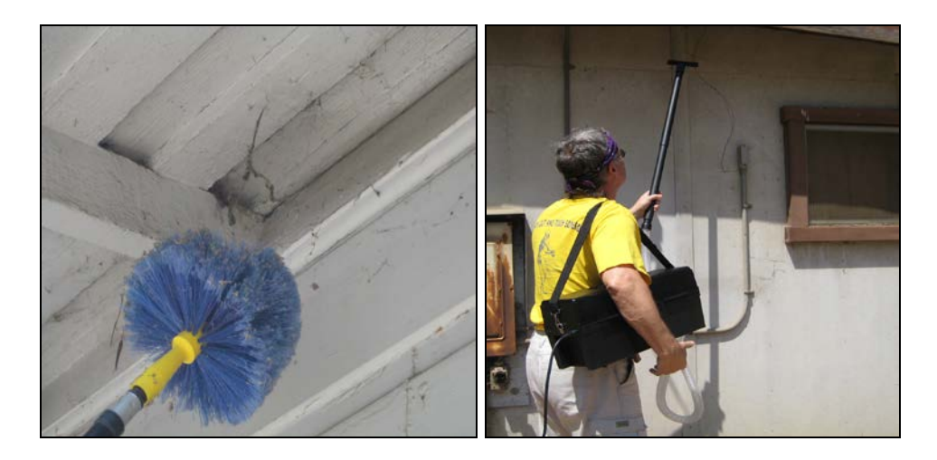
Fig. 3. Cobweb removal. Left , Webster cobweb brush at end of telescoping extension handle being used to remove cobwebs under an eave; right , cobwebs being removed with Omega Vac Supreme.

section. This was remarkably similar. The difference was attributable to the wall area below the eaves of some Tengard sections being taller, therefore requiring slightly more spray. The brushings, vacuuming, and spraying were made 17 - 18 Jun 2009, within 2 d of the pre-treatment census.